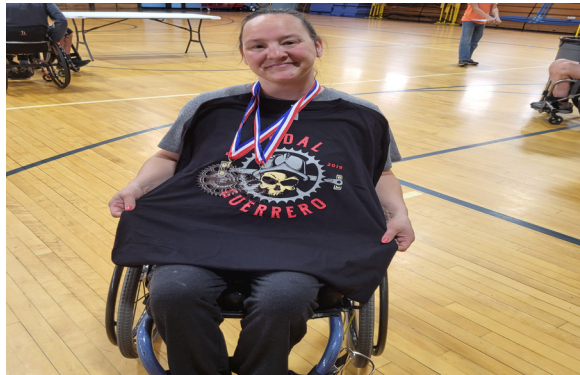
Wichita Adaptive Sports - Cycling PVA Members

OG Club i.e. PVA Members throughout the County have been attending the Wichita Adaptive Sports Cycling Race for the past 8 years.