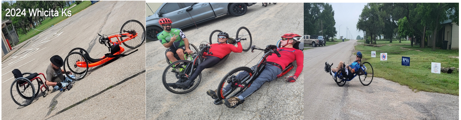
Wichita Adaptive Sports Race JUNE 2024 - 1st Race - Pedal Guererro SWAG Winner