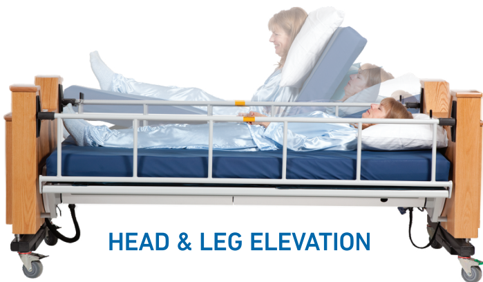
HEAD & LEG ELEVATION