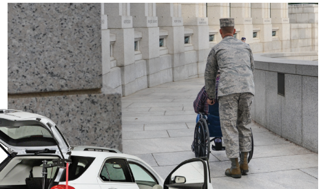
Scooter lifts, turning seats, and driving accessories