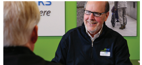
Certified Mobility Consultants Provide Comprehensive Needs Analysis

MobilityWorks is committed to serving you. Contact us today so we can evaluate your needs and find a solution that best fits your lifestyle.